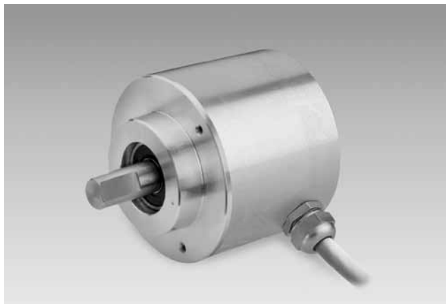
GE355 with clamping flange